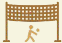
VOLLEY BALL COURT