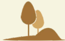
LANDSCAPE GARDEN WITH SENIOR CITIZEN SEATING